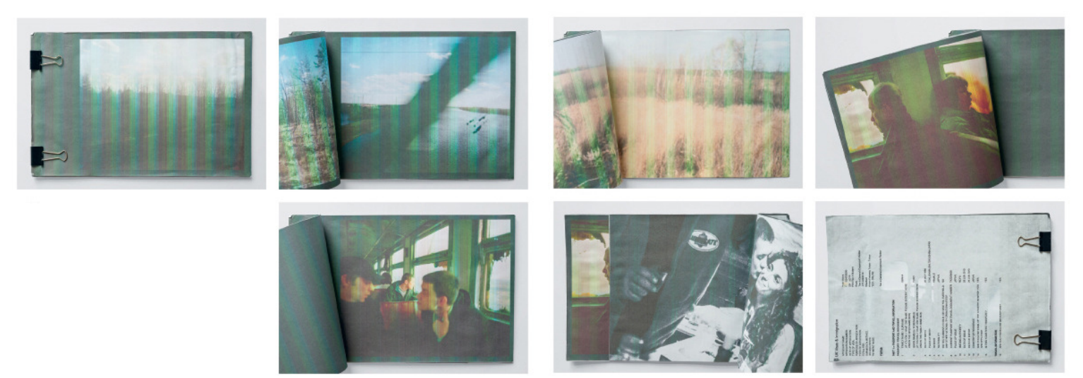
Untitled, 28.7 x 19 cm, Dummy by Kazuma Obara

The Japanese photographer published « 30 » in 2016. It deals with the Chernobyl disaster in 1986. The handmade edition of 86 copies contains the three titles «Exposure», «Everlasting» and «Newspaper».