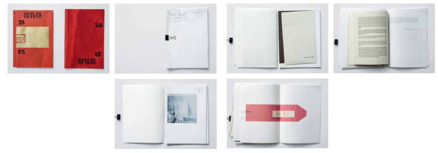
exposure, 14.8 x 21 cm, Dummy by Kazuma Obara

<u>Photo Book Project</u> Portfolio with a sequence of 8-12 images from a reportage or a series.